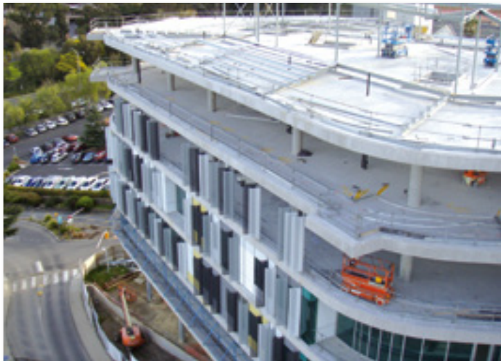
The roof is underway

It looks like a typical construction site but come closer and you can feel it. There is definitely a shared commitment and the sense that anything is possible. Exactly the spirit you'd expect for a building like this.