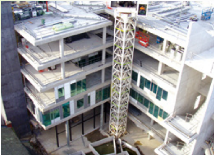
Aerial view overlooking part of the courtyard