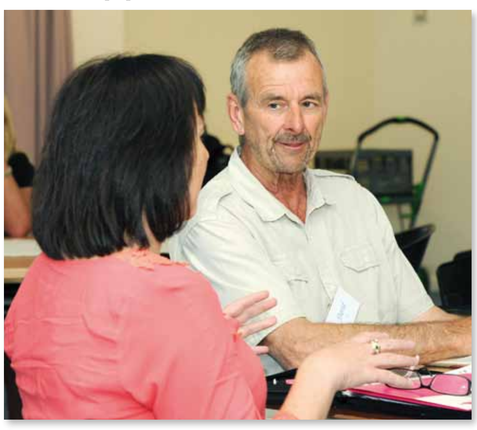
Community Consultation Forum provides vital input.

Community consultation has been an integral part of the planning process. In December 2011, the Cancer Services' Community Consultation