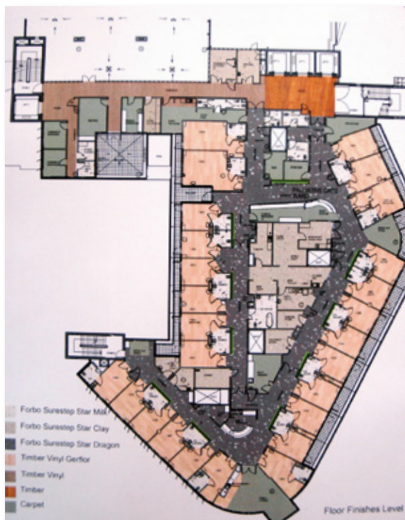
The design of the new Palliative Care wards

"Our mission statement is 'You Matter'. 'You' doesn't just mean patients, family, and carers, it includes staff and the community; everybody matters. We should be framing what we do with this in mind."