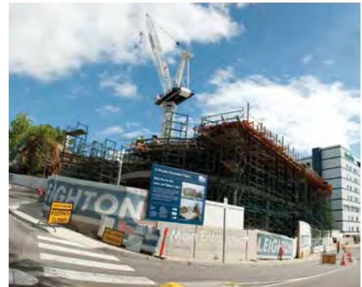
Construction of Level 5 now complete.