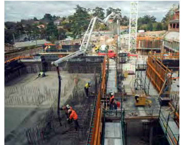
Construction of the radiation bunkers well on their way.

Continued fundraising support is needed for the Centre's full fit-out. With $10 million left to raise, through individual donations, philanthropic foundations and the business community, every dollar counts.